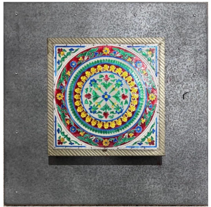
Created piece of Art from bajoth with broken legs mounted to galvanized box.