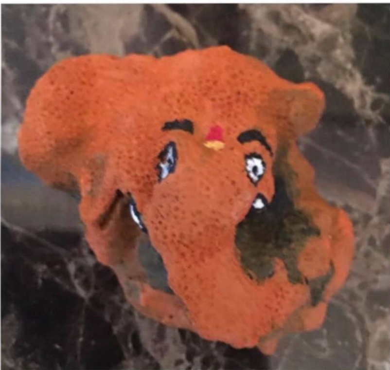
On sea shell Mahendra found at beach