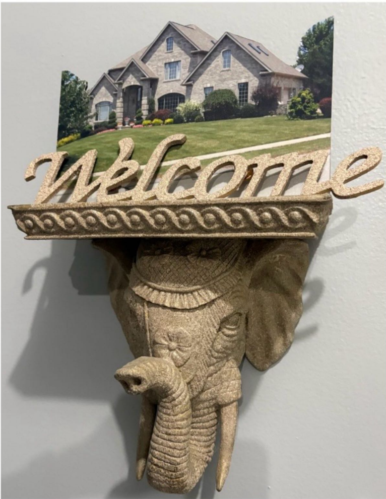
Welcome sign, house cutout on top of fiberglass elephant face statue covered with sand spray to create ruin effect.