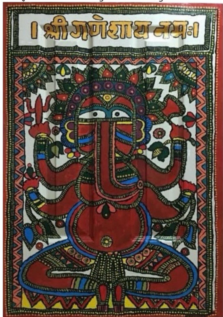
Ganesh on half unused leftover door.