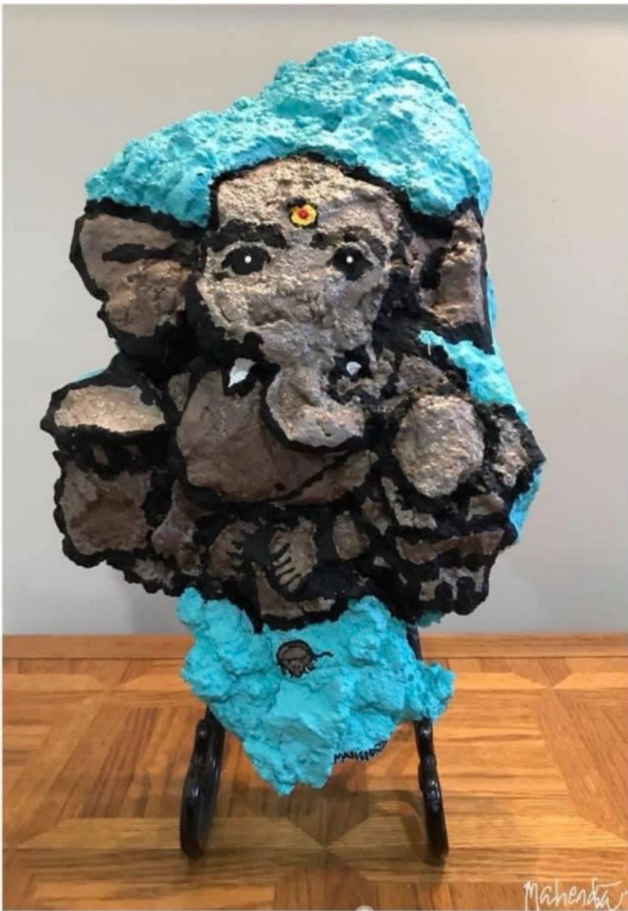
On chunk of concrete found at construction site.