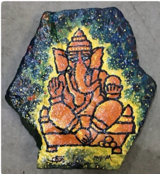
Ganesh on stone found from trail.