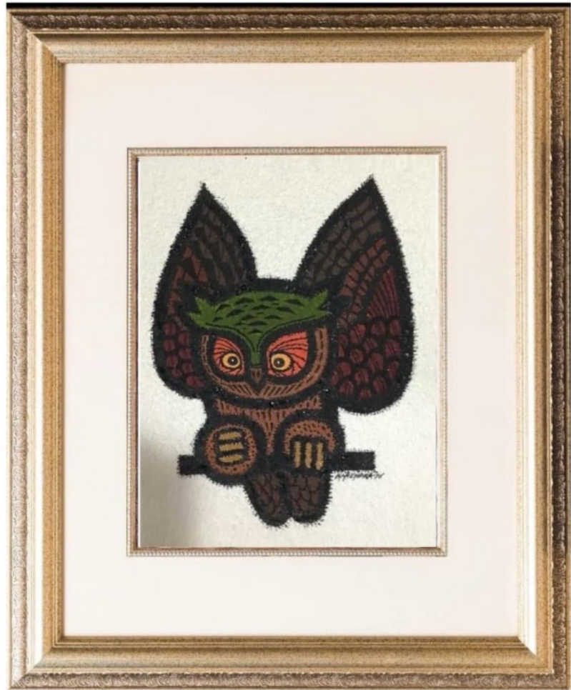
Owl on thermocol board.