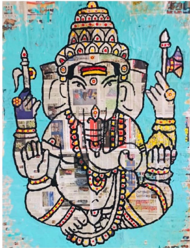
Artwork created on newspapers