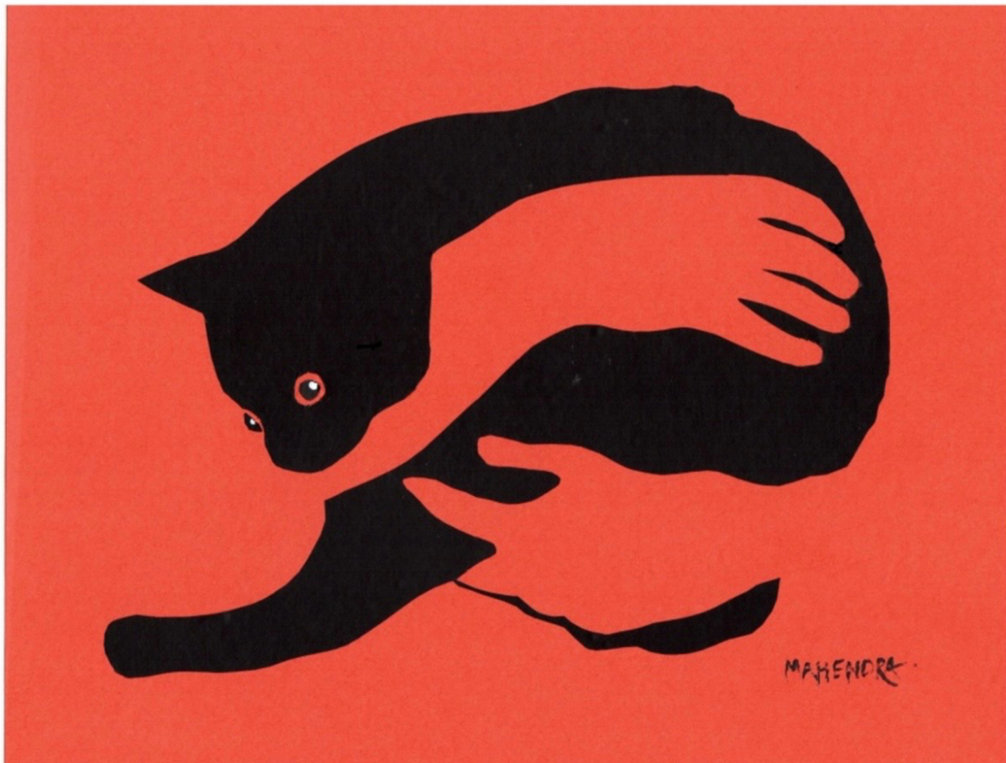
Man holding cat