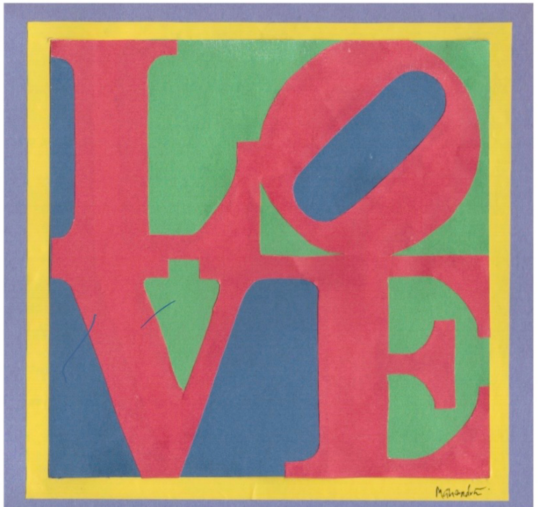
Original Artist: Robert Indiana ( 1928 - 2018 )