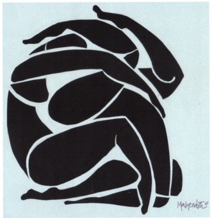
Henri Matisse inspiration.